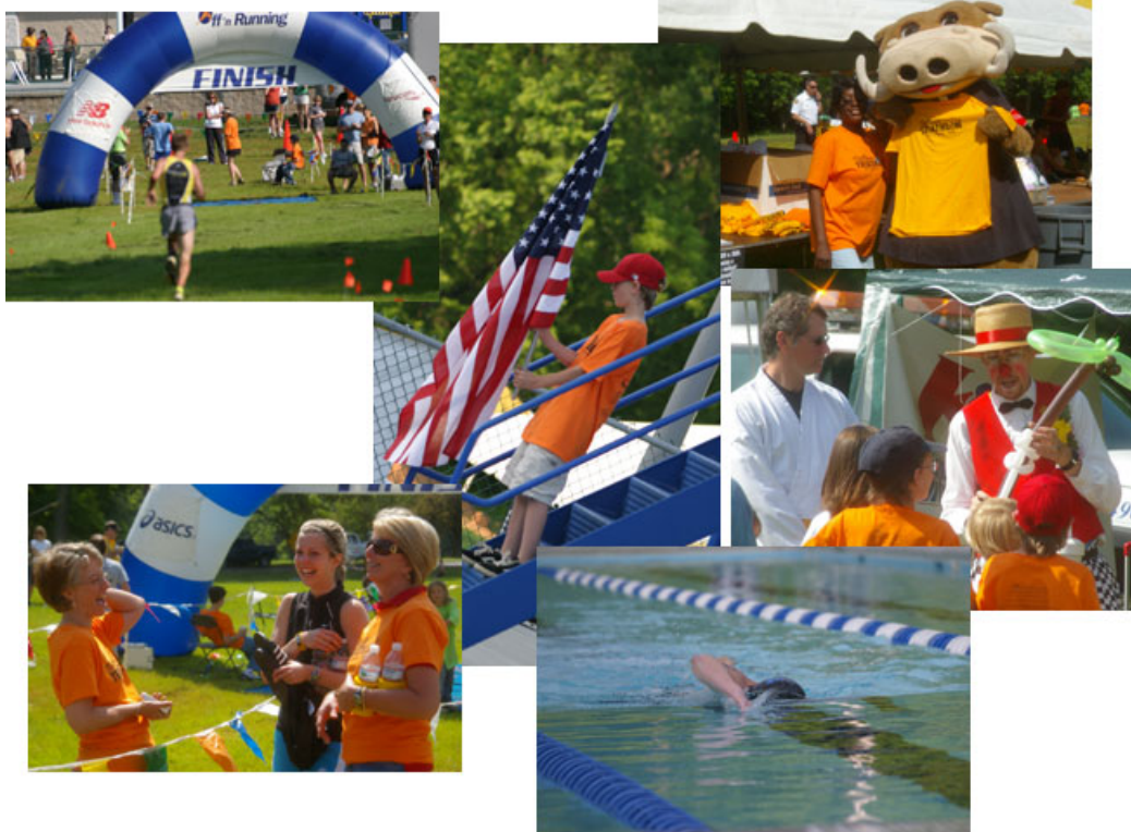
Folks having fun at the 11 th Annual Excellence Triathlon: Wally the Warthog, Mr. Pokeeto the clown & members of Karate International entertained kids of all ages, while spectators cheered their athletes in.