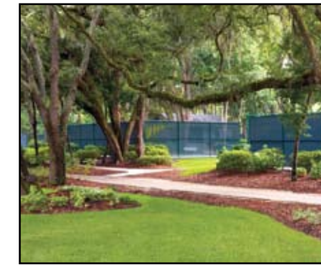
Har-Tru ® Tennis Courts

Dinner reservations are the individual guest's responsibility and should be made as early as possible to guarantee prime time dining. The daily dress at Amelia Island Plantation is resort casual, but ripped, torn or frayed clothing is unacceptable.