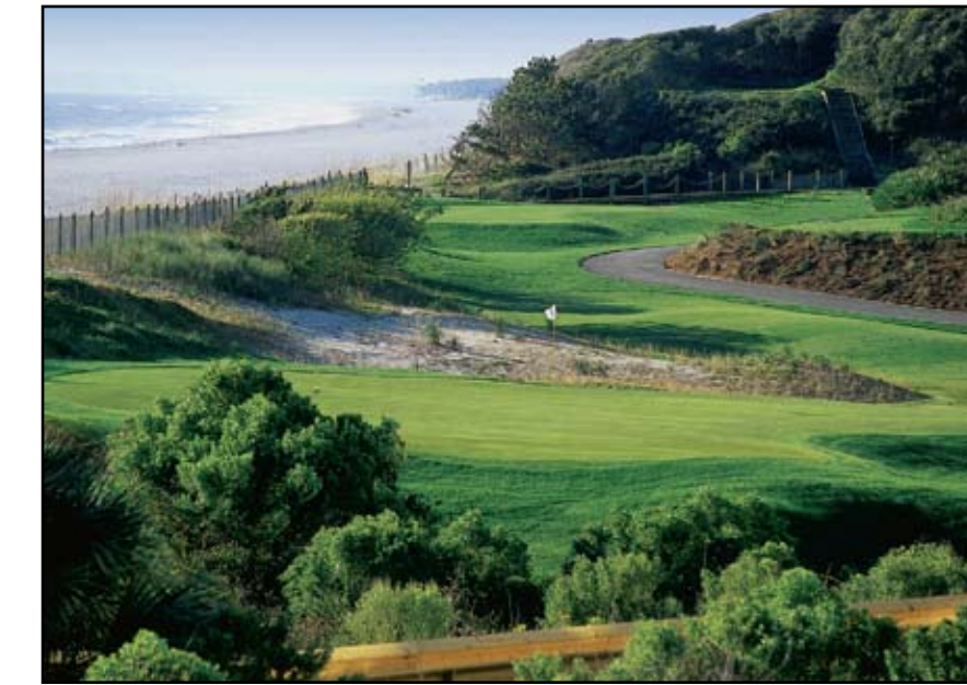
Ocean Links Golf Course