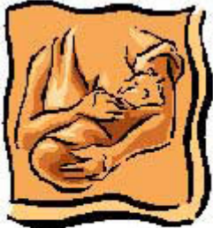
Helping Moms Breastfeed Successfully

Did you know that the US Surgeon General recommends babies be fed ONLY breast milk for their first 6 months of life. And breastfeeding is best for 12 months?