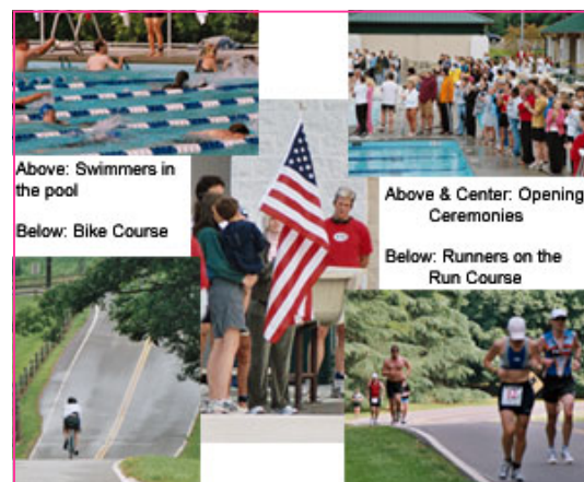
Above: Swimmers in the pool

There is no excuse for abuse National Domestic Violence Hotline: 1-800-799-SAFE